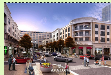
Avalon, Alpharetta, Georgia

schools as well as county and municipal governments from the resulting sales, property and employment revenues that the massive new complex will generate. Phase one